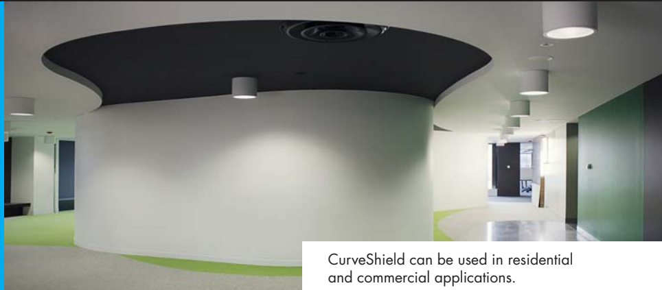
CurveShield can be used in residential and commercial applications.

CurveShield is standard plasterboard made from a core of gypsum sandwiched between two layers of heavy duty recycled paper. The face paper is coloured ivory ready for paint or wall paper finish.